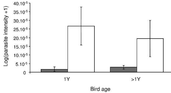
FIGURE 2. Parasitemia (log+1) of male (grey boxes) and female (empty boxes) house sparrows aged 1 yr (1Y) or older (>1Y). Means \pm SE are reported.

McCurdy et al., 1998; Rolff, 2002; van Oers et al., 2010). Alternatively, differences in parasitemia between males and females might reflect different ethologies between sexes. For instance, females might be an easy target for vectors during the extended time spent in the nest to incubate eggs and brood hatchlings (Chernin, 1952; Peirce and Marquiss, 1983; Korpimäki et al., 1993; Norris et al., 1994). However, in addition to higher parasitemia, this should also result in a higher prevalence in females than in males. Our finding of statistically similar prevalence between sexes does not support a differential exposure hypothesis. Tentatively, one might speculate that the cost of reproduction is higher in females than in males. This differential reproductive effort could potentially make female immune response less competent when facing a malaria infection (Richner et al., 1995; Williams, 2005), but this idea remains to be tested.