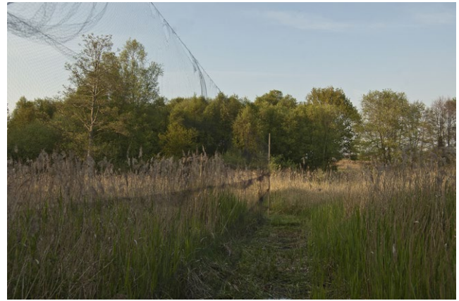
FIGURE 1 Mist nets are widely used to catch passerine birds in scrub and other habitats

This study quantifies the reported mortality rate among common passerine species recaptured using mist nets, using data submitted to the British Trust for Ornithology (BTO) Ringing Scheme. Factors which may influence the likelihood of mortality are investigated